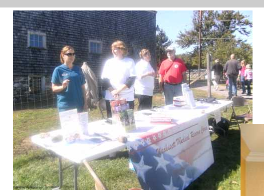
Princeton, August 2009