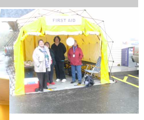
Westminster, First Aid Tent, in the rain, September 2009