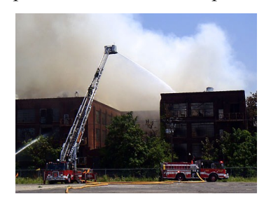
Firefighters battle the latest fire in the former Remington Arms factory Saturday, Aug. 4.

SATURDAY, AUG. 4, 3:30 p.m.: Stratford's Medical Reserve Corps has been sent to the scene of a massive fire at the former Remington Arms factory in Bridgeport. The MRC will help in