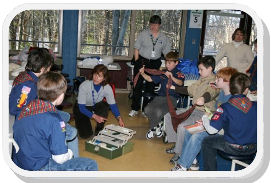
Upper Merrimac Valley MRC volunteers teach a Boy Scout troop First Aid.